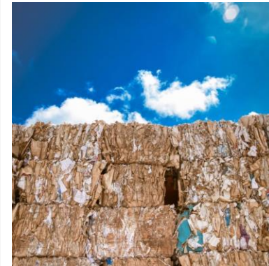
Environmental, Economic, & Effective Waste Mgmt. Systems